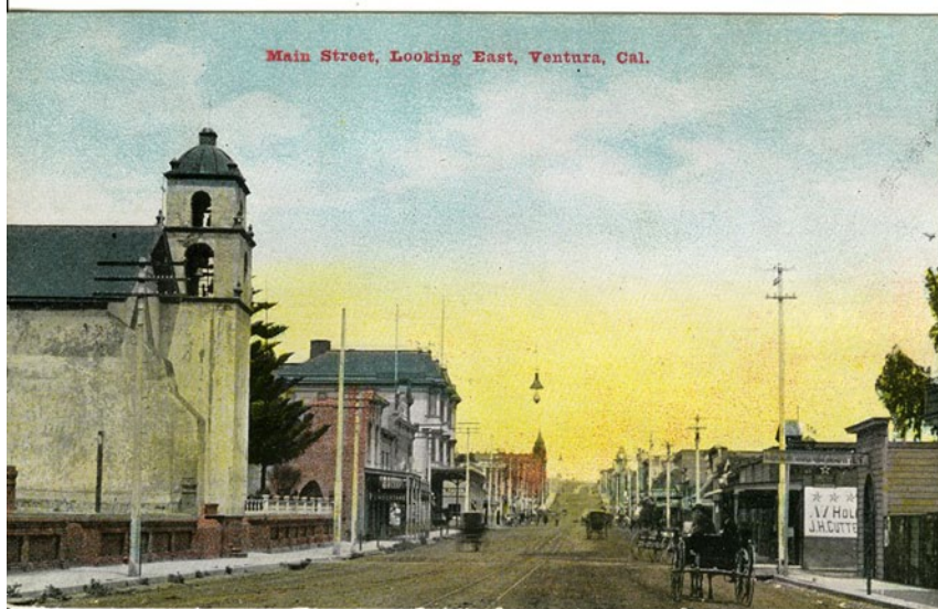
Main Street of Ventura, 1890.

and contributed to common usage of the name. Although agriculture has played a central role in the life of both the city and the county since the very beginning, the explosive growth of the oil industry has also exercised a significant influence.