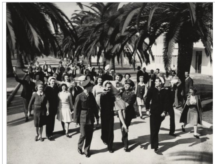
Returning Soldiers Celebrate at George Pepperdine College, 1944

University Archives to make the school's heritage more widely known as it approaches this significant milestone.