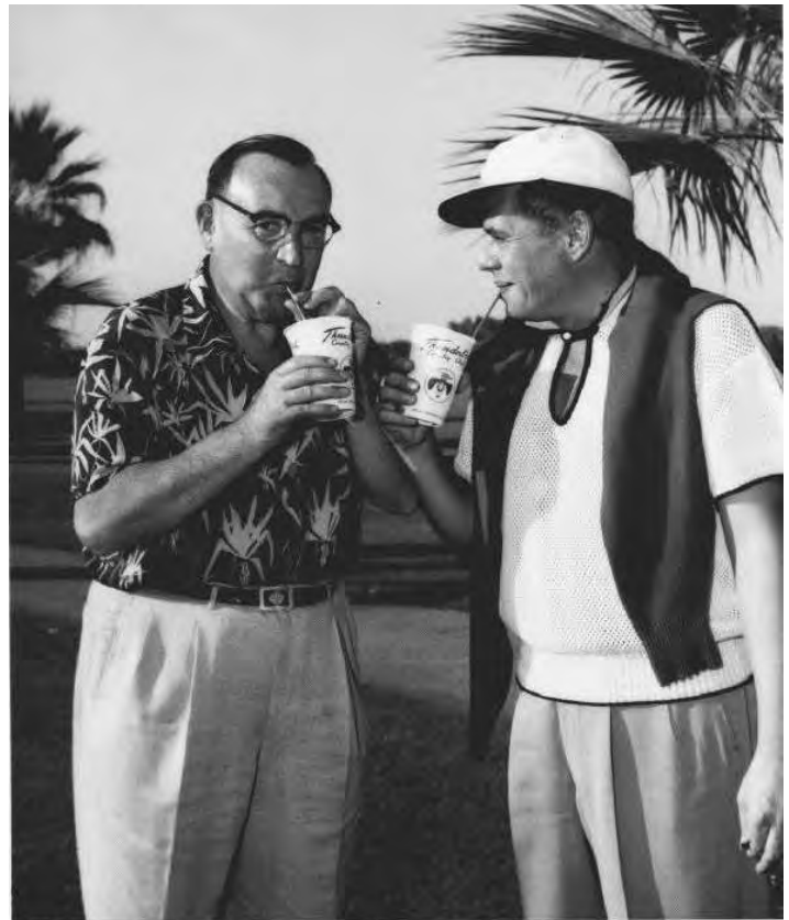
EDMUND G. (PAT) BROWN AND DESI ARNAZ IN PALM SPRINGS (1905.00002 BROWN, EDMUND G.-113;)

The opening reception will take place at Sunnylands Center & Gardens on Thursday, May 8th. Designed by Mid-Century Modern architect A. Quincy Jones, Sunnylands was the winter home of Ambassador Walter Annenberg and his wife Leonore. During the reception, attendees can check out the exhibition "The Pleasure of Your Company: Entertaining at