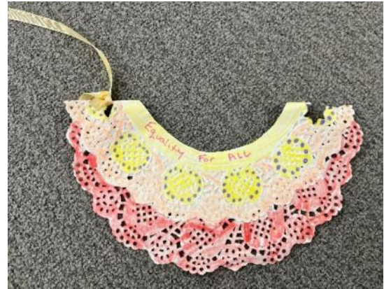
ABOVE: Members of the community stand in front of the memorial display honoring Supreme Court Justice Ruth Bader Ginsburg. TOP RIGHT: Hand drawn and handwritten card addressed to Justice Ginsburg. BOTTOM RIGHT: Judge's collar made from a paper doily with crayon lettering and decorated with yellow ribbons.

The messages reflect the respect and affection the public held for Justice Ginsburg, and some relate how she directly influenced their lives. Collectively, the items reflect a deep community connection to RBG and the values she defended.