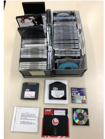
Example of the digital media found in the collection.

The born-digital materials were more challenging. The accession contained 188 disks (primarily optical discs), spread throughout the project envelopes. The inventory indicated the types and rough locations of most digital media carriers but was not always accurate, and some disks were not listed. Student workers used the inventory to find the disks, assigned them unique identifiers, and created a new inventory connecting the disk IDs to the projects in the original inventory. Any disks not