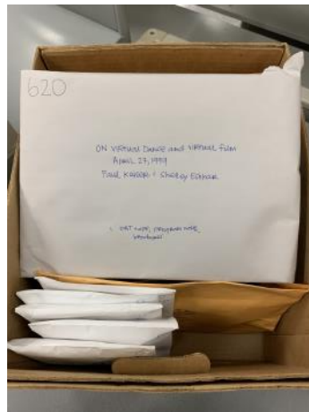
LEFT: One of the boxes in the accession prior to processing, showing the individual envelopes. RIGHT: One of the unprocessed envelopes, carefully labeled by CRCA prior to transfer to SC&A.